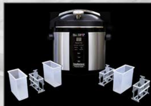
BSB 7008 - TintoDetector Pressure Cooker BSB 7009 - Staining Dishes BSB 7010 - Slide Holder (24)