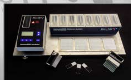
BSB 7000 - TintoDetector System BSB 7003 - TintoDetector Slide Holder